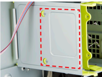
2.5" drive bay