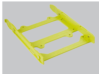
Tool-free 2.5"/3.5" HDD bracket